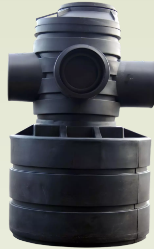
NBS 3.5 - 18

Independently tested over an 18 month period at a leading European testing facility, the Geoeceptor complies with EN 858 1-2. Proven to remove hydrocarbons from surface water to less than 1 mg/litre.