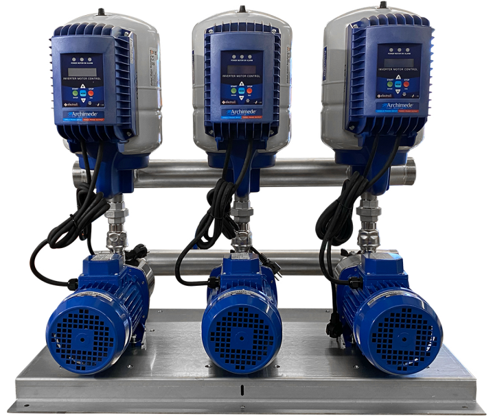
Operating Parameters: 0 - 50°C Max Temperature, Max Pressure: 8.5 Bar Max Flow 750l/min

Each pump operates within a 60-65dB noise rating at max speed, data recorded from 1m distance to a +/- 2.5dB.