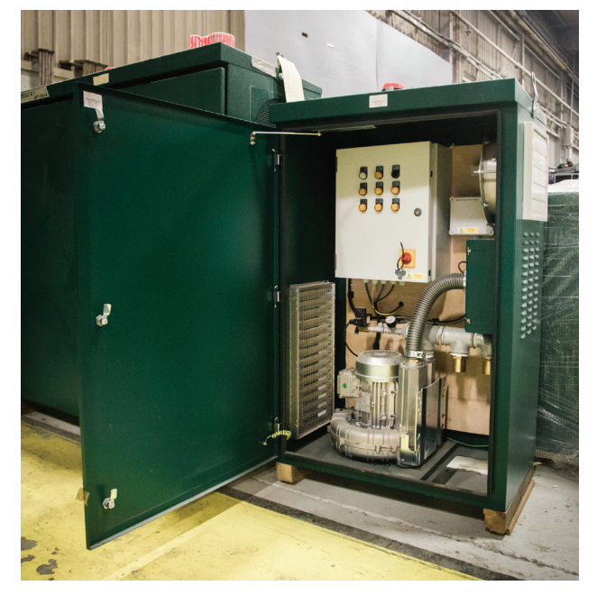
*This image is for illustration purposes only, actual product may vary.

The treated (final) effluent subsequently leaves the plant via the dipped outlet pipe. The movement of the fluid through the whole system is by gravity displacement. The option for a final clear effluent pumped discharge is available.