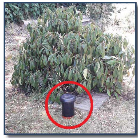
Poly-air installed on a septic tank ventilation pipe.