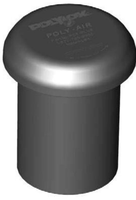
Poly-Air activated carbon vent filter.