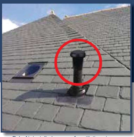
Poly-Air installed on a roof ventilation pipe.