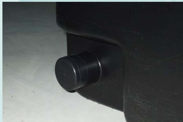
DN50 2" Connection Point.

The Forta Duo pump connects to the 3/4" brass threaded BSP outlet via the 3P Connector Kit