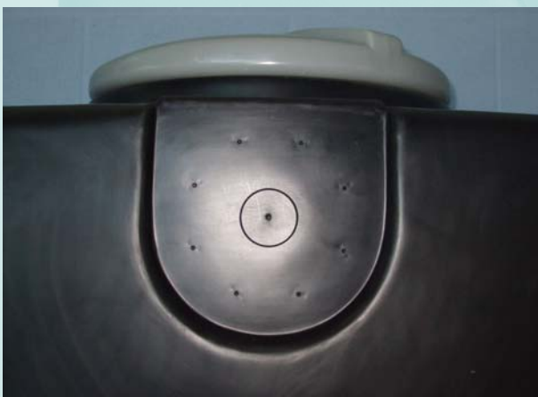
Marked Inlet Point and 460mm Lid